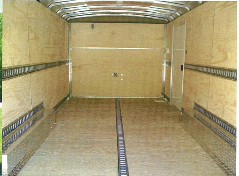
Photos show optional equipment available at additional charge