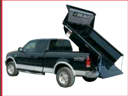
Cab protector optional