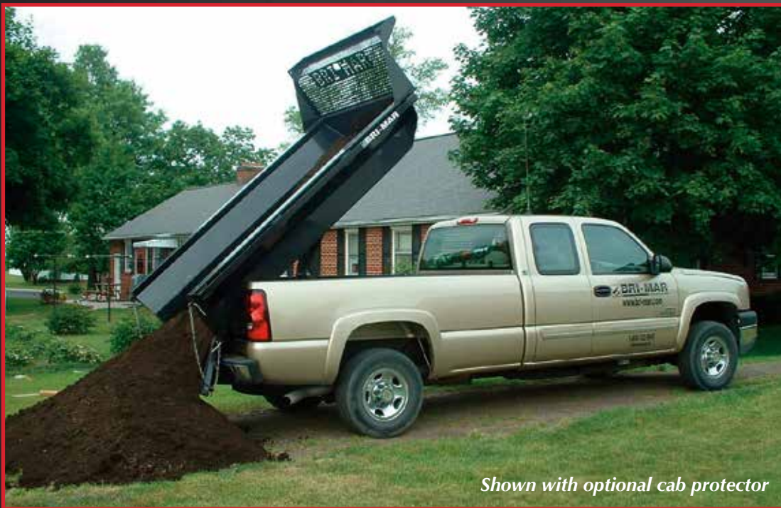
Shown with optional cab protector