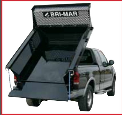
Cab protector optional

Pricing and Specifications subject to change without notification.